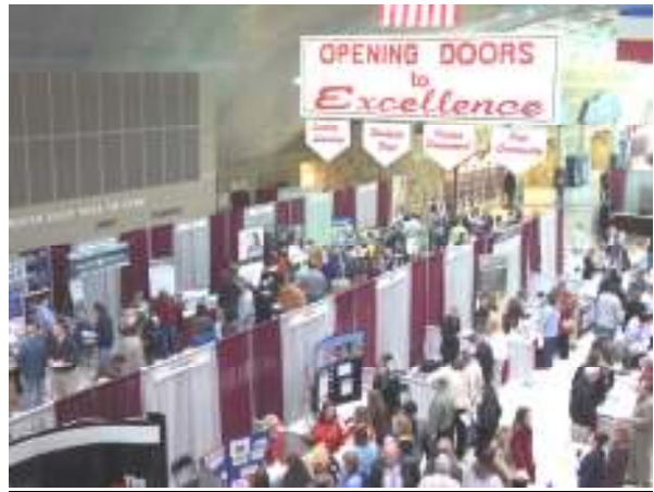
Views of the East wing of the High School Building during the Job Fair.