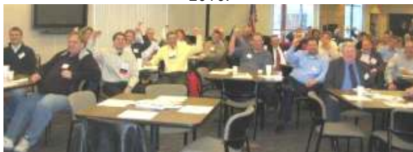
The Wright County cheer at our Annual Meeting in January 2010