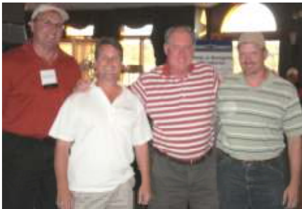
Wright Hennepin Electric Team