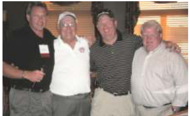
Second Place Winners: The Bauer Design Team