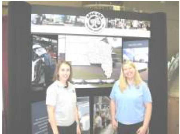
The Spee Dee Delivery Booth at the Job Fair