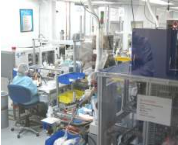
Sil-Pro Clean Room with Robots