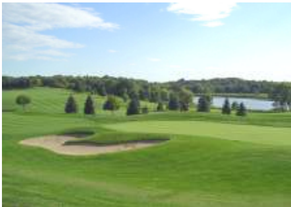
A scene from #10 tee box at the Wild Marsh Golf Course at our annual September event.