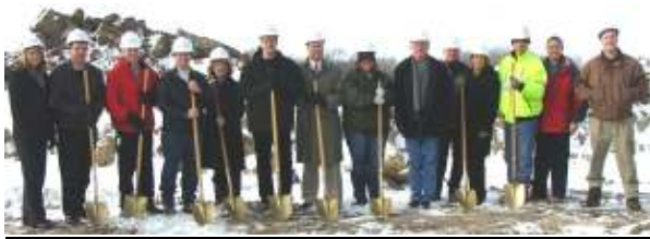
Ground breaking at Montrose for New Industrial Park in December.