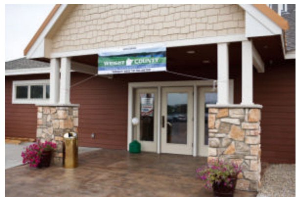
The Welcome Banner at the entry to the Riverwood National Golf Course Clubhouse in September