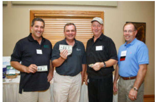
Winners of the Vantage Point Partners $100 ball-in-play game were The Franklin Outdoor Team, which is shown here celebrating.