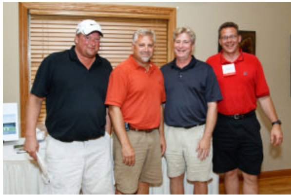
Second Place winners; the Bauer Design Team.