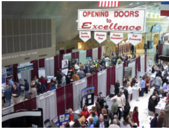
Views of the East wing of the High School Building during the Job Fair in March.