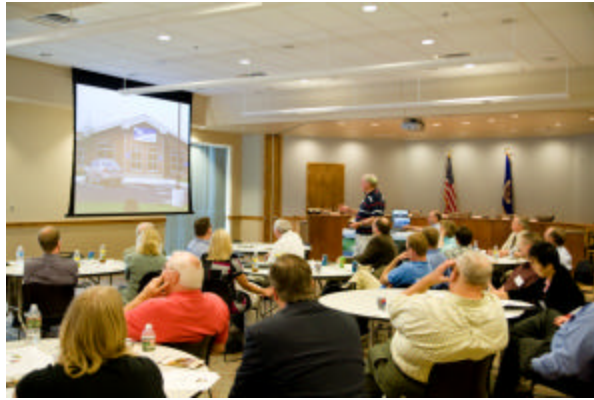
The audience at the June State of the Cities event.