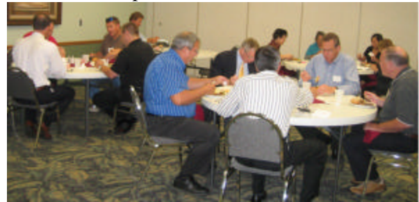
Members meeting members while networking.

Attendees rotated tables three times and ended up listening to several 3 minute presentations. Many new relationships occurred as a result.