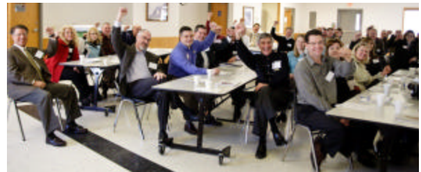
The Wright County cheer at our Annual Meeting in January 2009