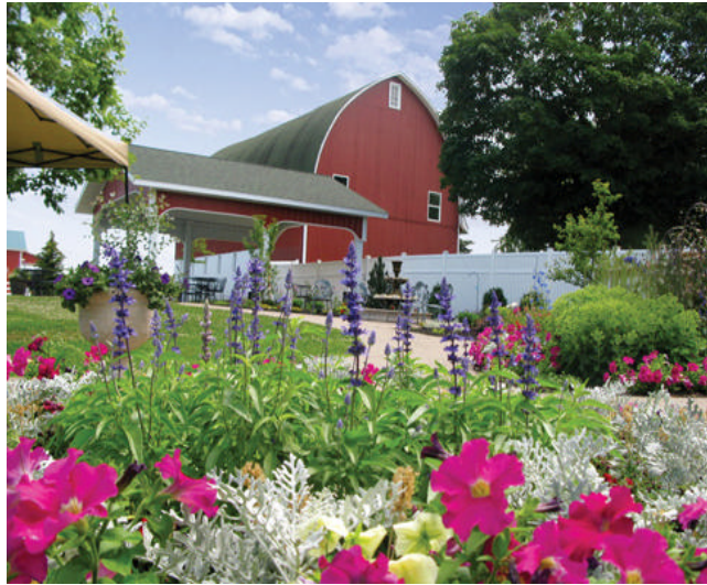
Woodland Hills Winery