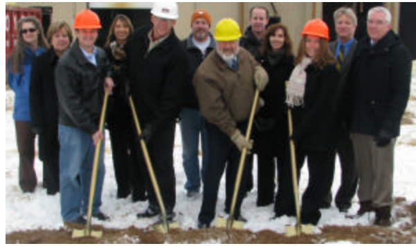
Ground breaking at Montrose for New Education Center.